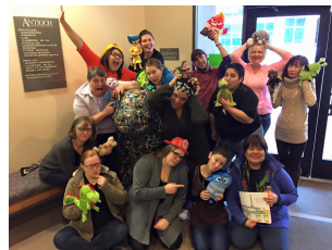
First PT Certificate Cohorts Celebrating National PT Awareness Week!